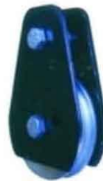
WST169 H503 SNATCH BLOCK